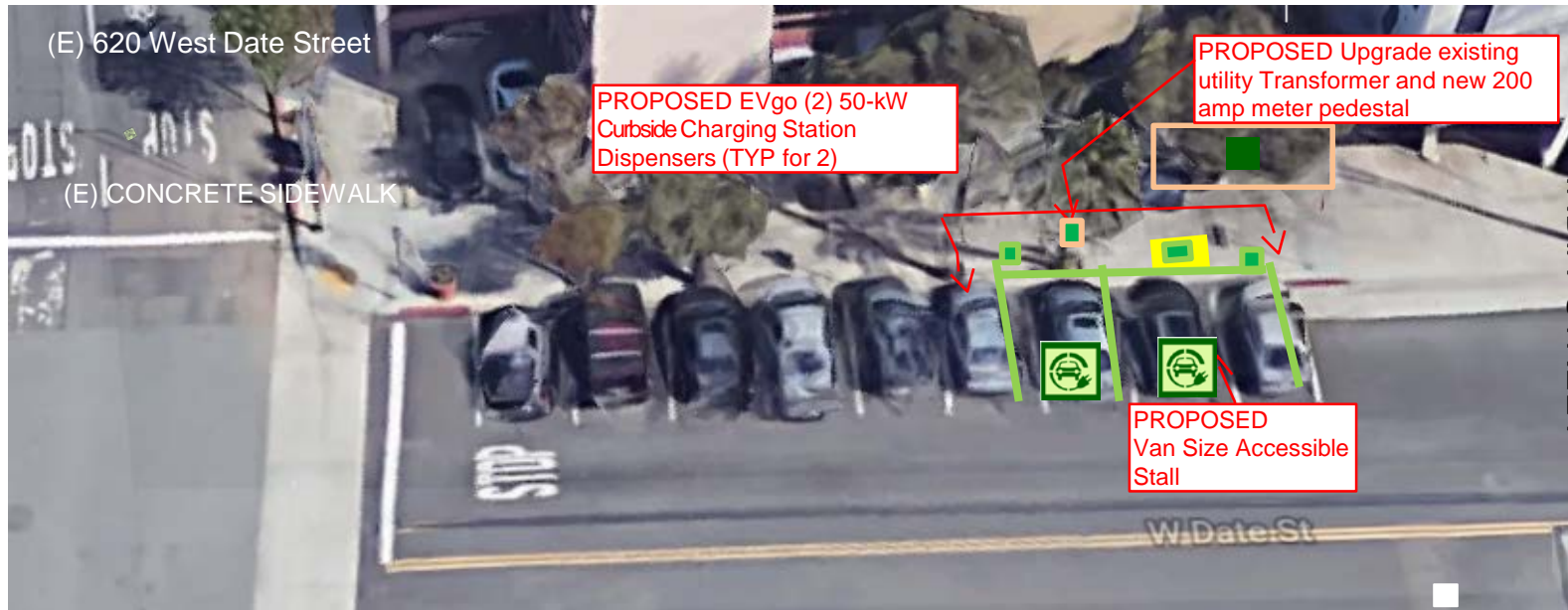
W. DATE STREET